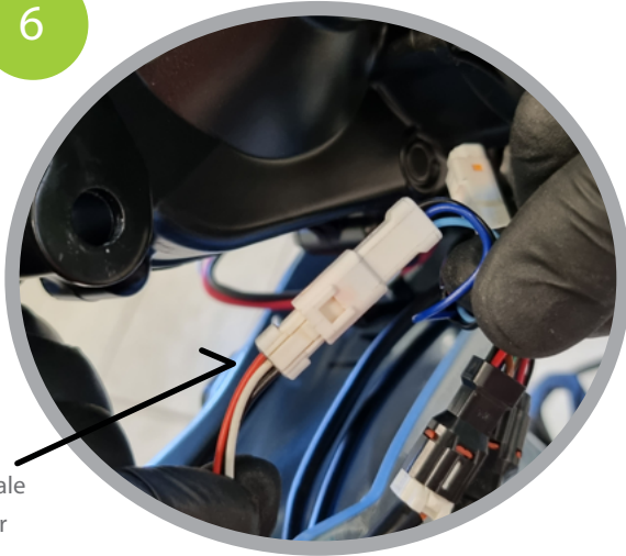
Eplus kit male connector