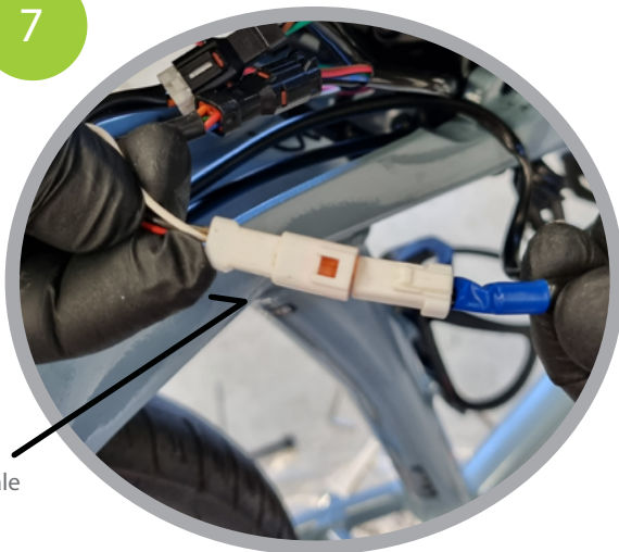
Eplus kit female connector

Connect the previously disconnected 3-pin connector to the female connector of our kit.