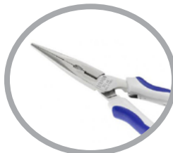
Long nose pliers