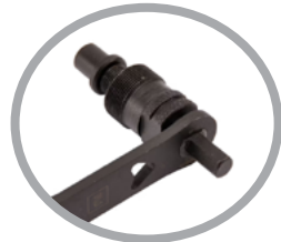
Crank arm extractor